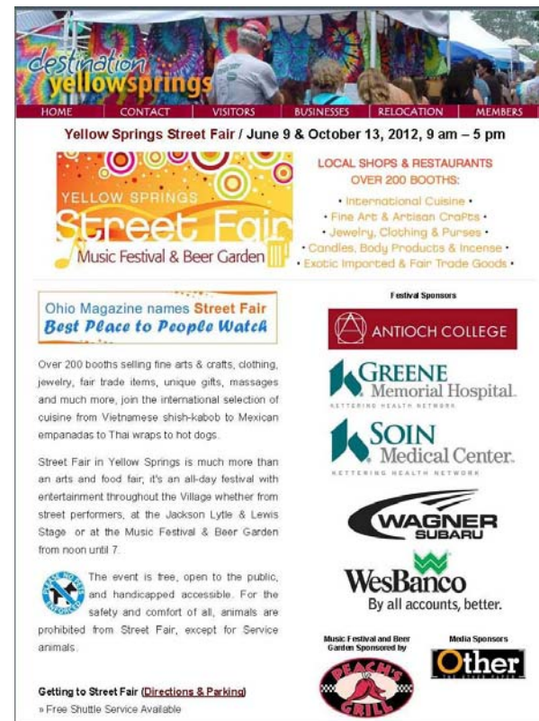
Street Fair - Sponsor logos with links