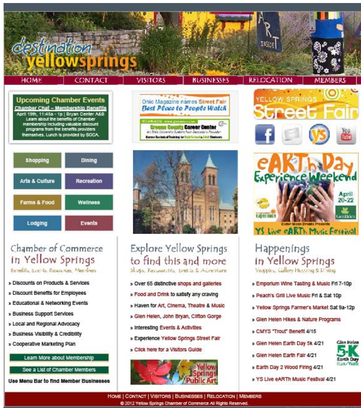
Home Page – Inviting & Informative