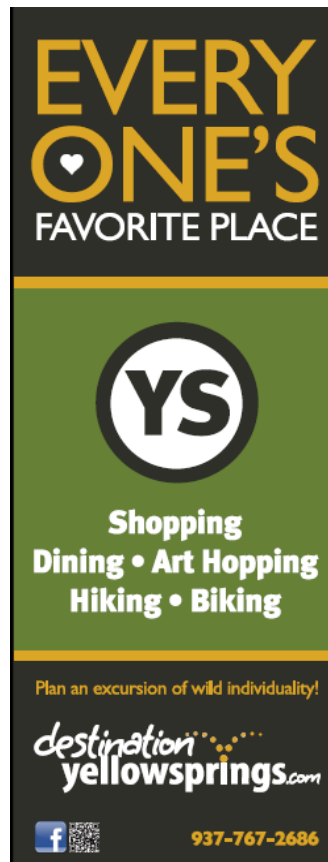
General Brand Ad: Various Publications

Specialty Ad: Gold Wing Rally Event Book, Ad & Web