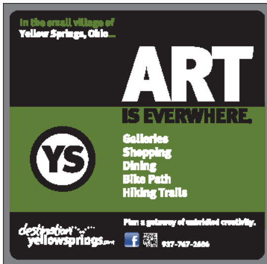
Specialty Ad: The Other Paper Arts Supplement